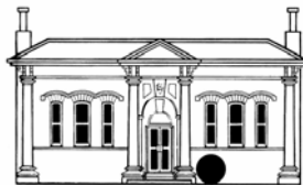
Nepean Historical Society Sorrento

Website: www.nepeanhistoricalsociety.asn.au