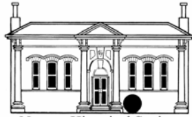
Nepean Historical Society Sorrento

Website: www.nepeanhistoricalsociety.asn.au